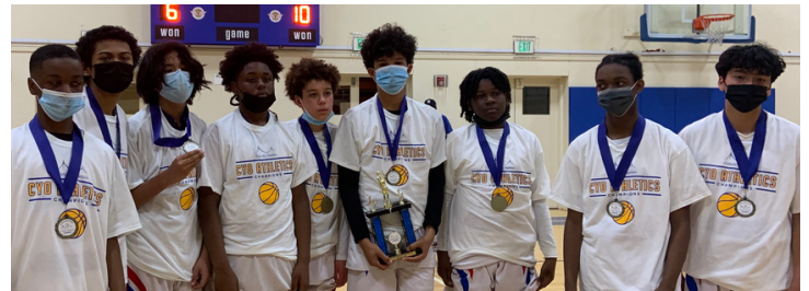
8th Grade Boys Basketball