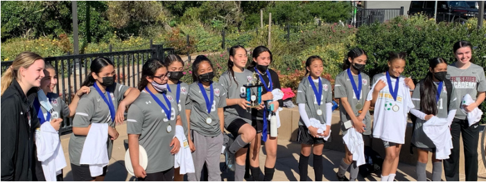
6th/7th Grade Girls Soccer