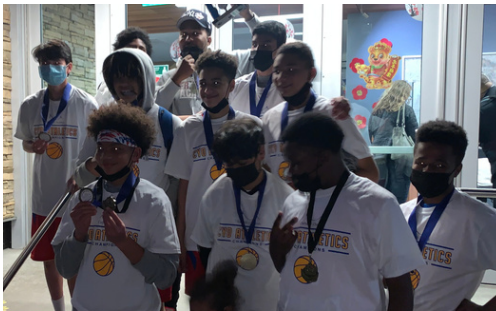
7th Grade Boys Basketball