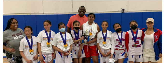
7th Grade Girls Basketball